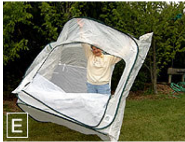
Step 5: Stand on the bottom corner of the skirting and lift your SpringHouse™ over your head. Push out on the center steel band (Shown in fig. D) and left up to separate the two sides of your SpringHouse™.