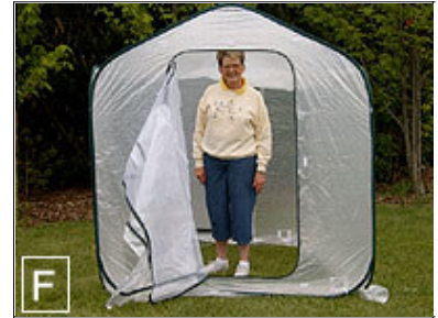
Step 6: Stand pm the bottom corner of the skirting and lift your SpringHouse™ over your head. Push out on the center steel band (Shown in fig. D) and left up to separate the two sides of your SpringHouse™.