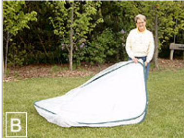
Step 2: Allow your SpringHouse™ to spring open.