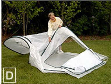
Step 4: Unzip the easiest accessible doorway and screen. Grab the center steel band and lift up to separate the two sides of your SpringHouse™.