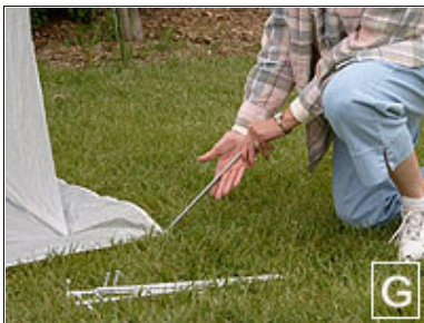
Step 7: Secure your SpringHouse™ using the supplied stakes. Insert the stakes into the stake holes of the skirt at 45° angles.