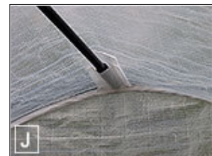
Step 9: Begin with the X-shaped fiberpole. (See "I"). Insert the capped ends into the pockets above the doorways. Then completely assemble the fiberpole. (See "J").