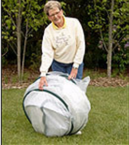
Step 1: Remove your SpringHouse™ from the pack.