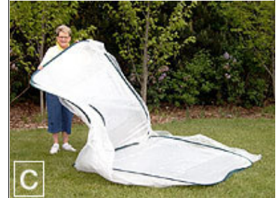
Step 3: Unfold your SpringHouse™ into 2 panels.